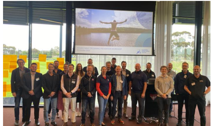
October 2023 AWSS Young Male Drowning Prevention Workshop, Melbourne.

area. The group determined four major priorities required for progress in this Focus Area of the AWSS 2030 (below) and came away with several important learnings relevant for young male drowning prevention efforts (synthesised on next page).