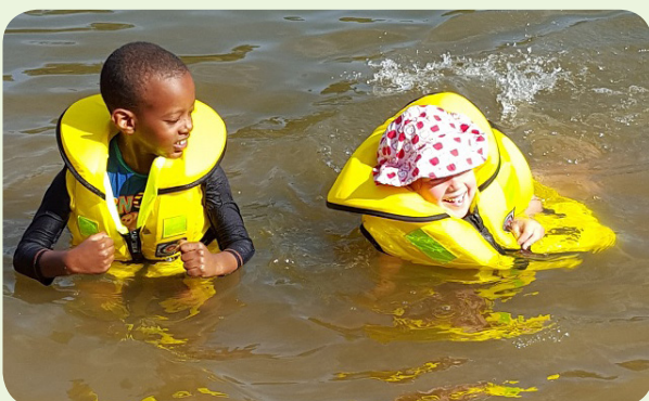
Swim 4 Life - January 2017